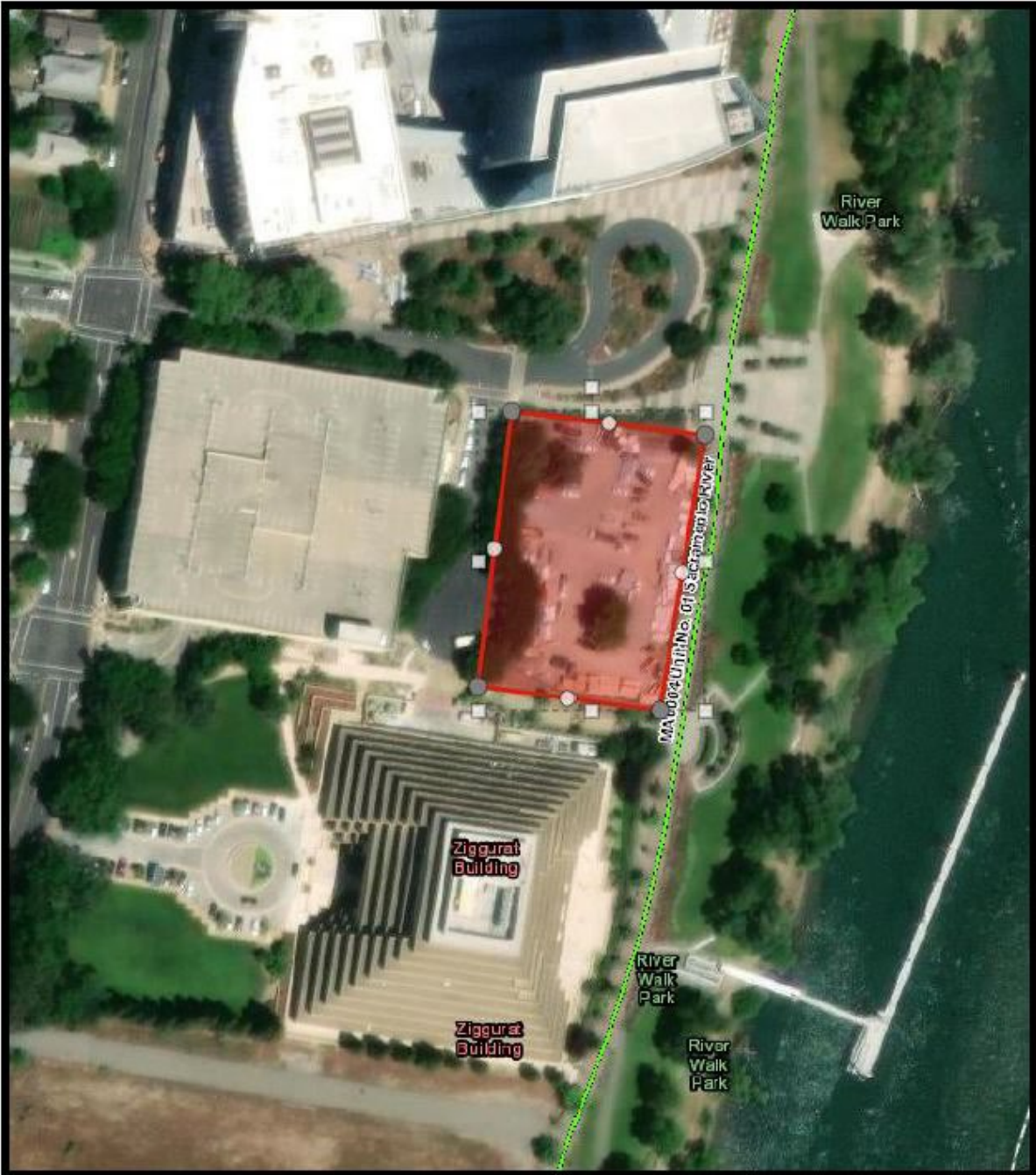
3) Approximate project footprint map